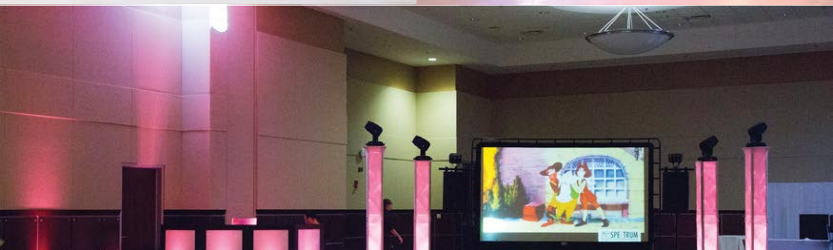
TOTEM PACKAGE W/ VIDEO *VIDEO SCREEN PROVIDED*