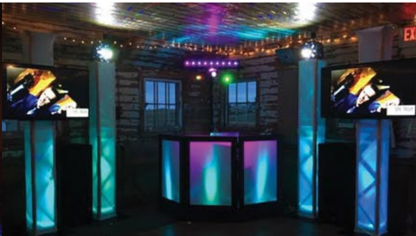
TOTEM PACKAGE W/ TV'S