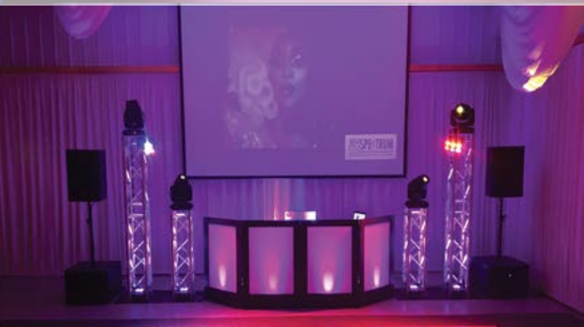
TOTEM PACKAGE W/ NO SCRIMS *VIDEO SCREEN PROVIDED*