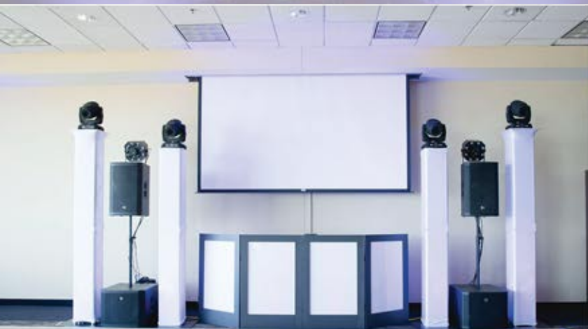
TOTEM PACKAGE W/ VIDEO *SCREEN PROVIDED BY VENUE*